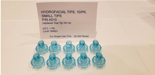
A010 – HydroFacial Small Tips, 10/pkg. $38.00 / pkg. (replaces Teal Tip part# 74114)