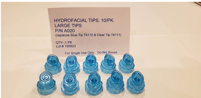
A020 – HydroFacial Large Tips, 10/pkg. $38.00 / pkg. (replaces Blue Tip part# 74112 & Clear Tip part# 74111)