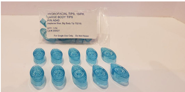
A040 – HydroFacial Large Body Tips, 10/pkg. $40.00 / pkg. (replaces Blue, Big BodyTip part# 70218)