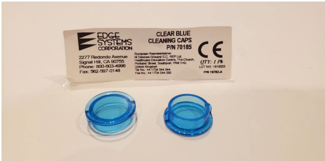
A030 – HydroFacial Cleaning Cap, 1/pkg. $10.00 / pkg. (part# 70185)