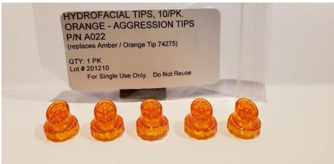
A022 – HydroFacial Orange - Aggression Tips, 10/pkg. $42.50 / pkg. (replaces Orange / Amber Tip part# 74275)